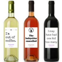
Wine Bottle Specials!!

Summer Fiesta Friday, May 31st 6pm Cocktails 7pm Dinner $29.95++